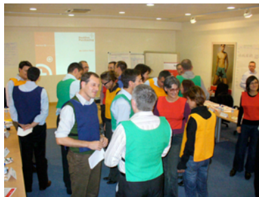
Teams learn about cultural differences in negotiation during a Red Sheet training course

Our unique Red Sheet planning tool, specifically designed to encourage collaborative working, enables the negotiation team begin to plan. The structured Red Sheet approach takes the team through a series of activities designed to put you in the best possible position on the day and reduce the reliance on poker faces and theatrical stunts. The team identifies the type of game that is being played using Game Theory concepts and how to switch the game to one that is more likely to achieve the desired results. This combined with an assessment of personalities of the negotiation team and an assessment of what is driving the balance of power leads to an extremely potent negotiation approach that can achieve outstanding results.