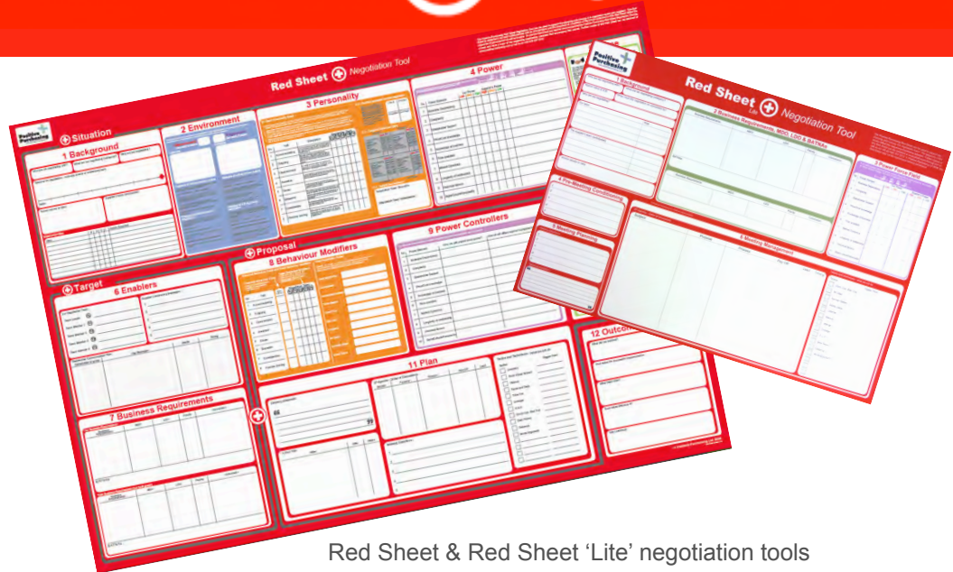
Red Sheet & Red Sheet 'Lite' negotiation tools

The Red Sheet negotiation tool and Red Sheet Lite are poster sized collaborative negotiation tools. It is designed to be worked on by a team on the wall or round a table. The team progressively works through each section, completing the planning for the negotiation. The outcome is a very powerful approach that equips the team to go into the negotiation with the power on their side.